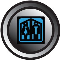
All Parties invited