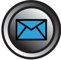
Personal Email Logs